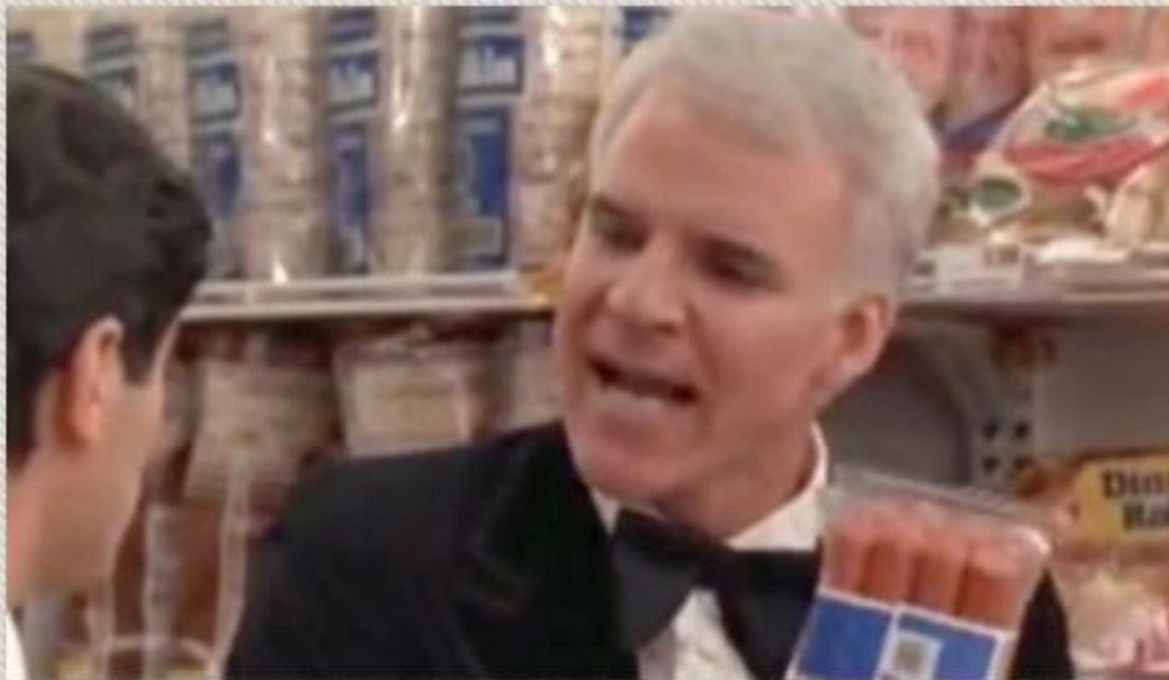
How Many Hot Dogs And Buns Should He Buy?